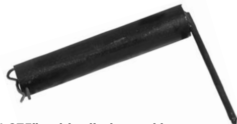
10" x 1.875" cold rolled round bar Handle installed with 5/16" hole for bridge pin Part No. T-ST-1875 ROUND