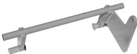
Gooseneck Support Bar Used to lift gooseneck off truck frame All necessary mounting hardware included Part No. T-ST-NECKSUPP