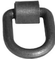
1" x 5" "D" Lashing Ring Straight With mounting clip Part No. T-ST-DRING