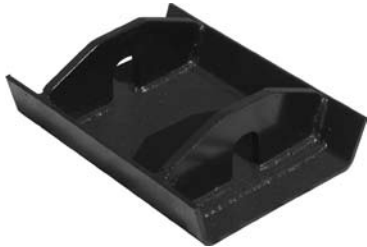
12" x 16" Cylinder Lifting Pad Used with Challenger single 6" and 8" cylinder Ground bearing model only Part No. T-ST-SBOOT