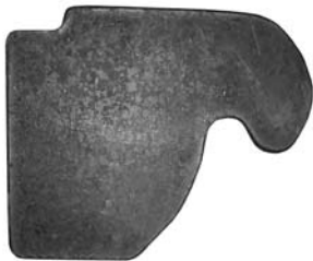
9" x 17" x 3" Gooseneck Hook 2 required for set Used with Challenger RG model Ground bearing model only Part No. T-ST-STDGHOOK