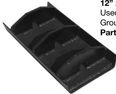
12" x 24" Cylinder Lifting Pad Used with Challenger twin 6" and 8" cylinder Ground bearing model only Part No. T-ST-DBOOT