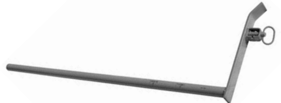
Stiff Leg Handle and Lock Assembly 17" x 3" flat bar handle with spring loaded lock Part No. T-ST-STIFFHANDLE