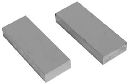
2" x 5" x 12.75" Solid Bar Part No. T-ST-STIFFBLOCK1275