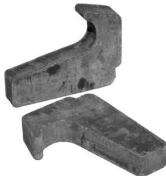
11" x 15" x 3" Trailer Bed Hook 2 required for set Used with Challenger NGB model Non ground bearing model only Part No. T-ST-NGBBHOOK