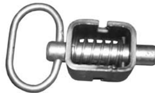
Lock assembly for TPIST-STIFFHANDLE Part No. T-ST-B2958