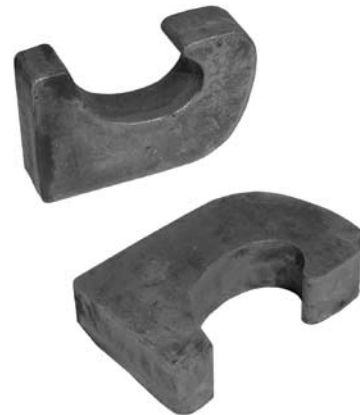
12" x 12" x 3" Trailer Bed Hook 2 required for set Used with Challenger RG model Ground bearing model only Part No. T-ST-STDBHOOK