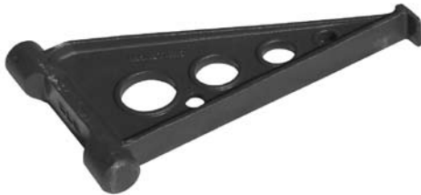
12" Swing Out Bracket Mounting hardware separate Part No. T-ST-ORIGGER