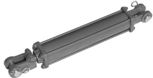
2.5" X 12" Tie rod cylinder 2500 PSI Used with No. T-ST-NECKSUPP Part No. T-HY- 215114