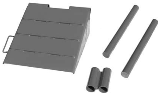
20" x 24" Folding Front Flip Ramp 8" tall at rear of ramp All necessary mounting hardware included Part No. T-ST-8FFRAMP